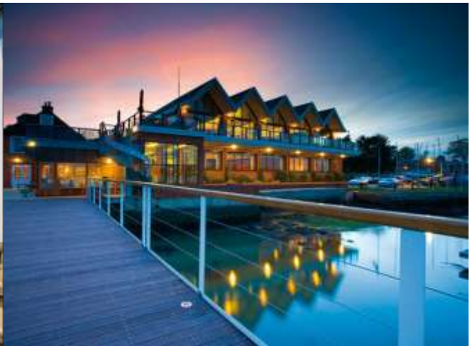
Royal Southern Y C before their own Marina was installed