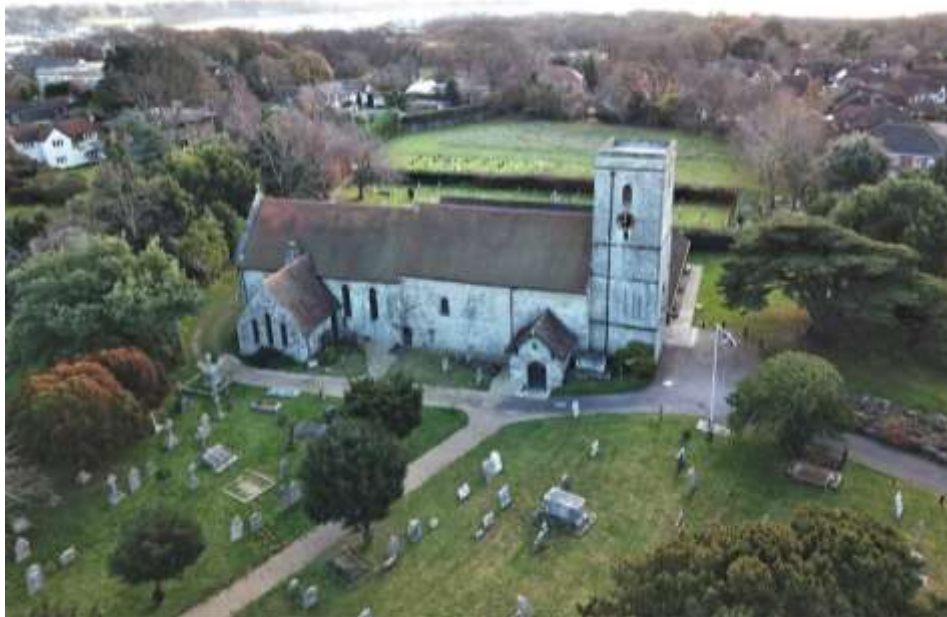
St Andrews Church, Hamble le Rice

Unless special arrangements have been made with RSYC's Bosun, skippers with boats are asked to settle their berthing fees and vacate the pontoons by the evening.