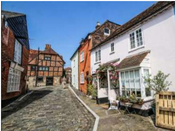
Hamble le Rice Village

The Hamble River hosts one of the densest concentrations of boats in the Solent area and its entrance is located on the East bank of the Southern end of Southampton Water. Your Commodore and Hon Sec considered and visited a number of locations and clubs in the Solent area for this year's rendezvous and came to the conclusion that the Royal Southern offered the best facilities and service of any of the clubs visited. Not only do they have twelve rooms of accommodation but they also have their own marina in front of the club with berths available for visitors. Additionally on page 5 you will find a full list of accommodation available in the village as provided by the RSYC. Hamble also has a railway station positioned close by the village.